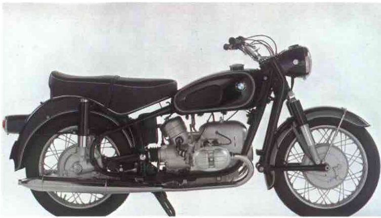
R 60 w/standard dualseat

The Bavarian Motor Works, known throughout the world as BMW, have been manufacturing motorcycles for 45 years. During all this time, two basic design features have been retained: