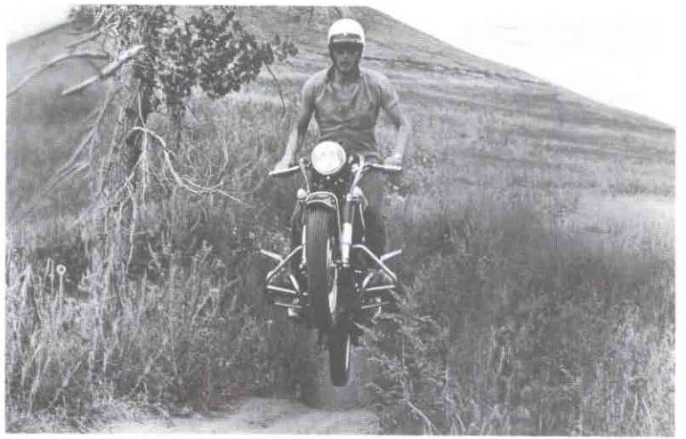
American Trials Rider on BMW Twin.