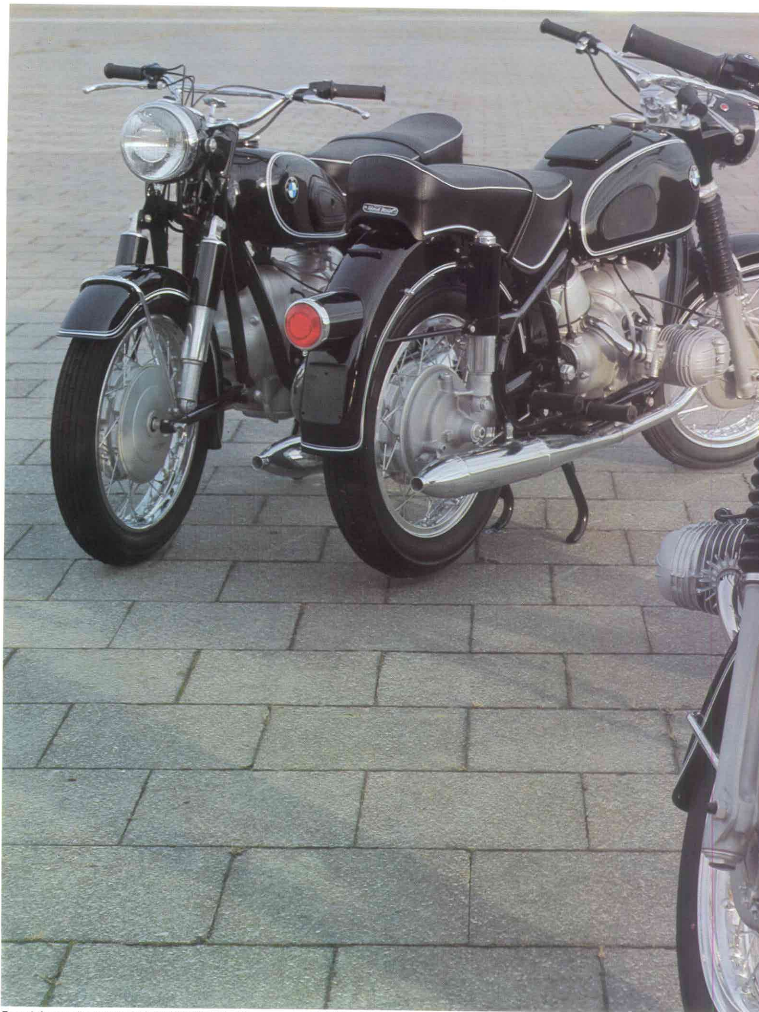
From left to right: BMW R 50, BMW R 60 US with sportstank, BMW R 69 US