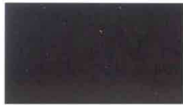
640 Avus Black