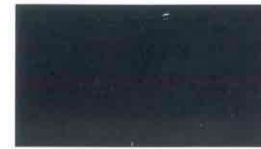
656 Classic Black Metallic