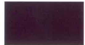
708 Navara Violet Metallic

Some models and colors are limited in availability therefore may not be offered at every dealer. We know from experience that the printing process cannot reproduce the original colors to exactness. We therefore recommend that you visit your dealer to see the actual colors. Colors are subject to change without notice.