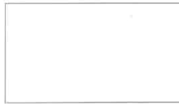
642 Alpine White