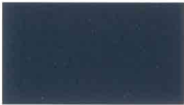
704 Graphite Metallic