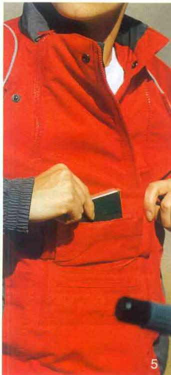
5 The water-tight outer pocket on BMW's red GORE-TEX® suit is a particularly practical feature for keeping your documents handy at all times.