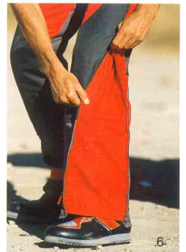
6 Long zippers and the wide pleat down the pant legs make it easy to put on and take off both of BMW's GORE-TEX® suits. The trouser bottoms fit tightly over your boots.