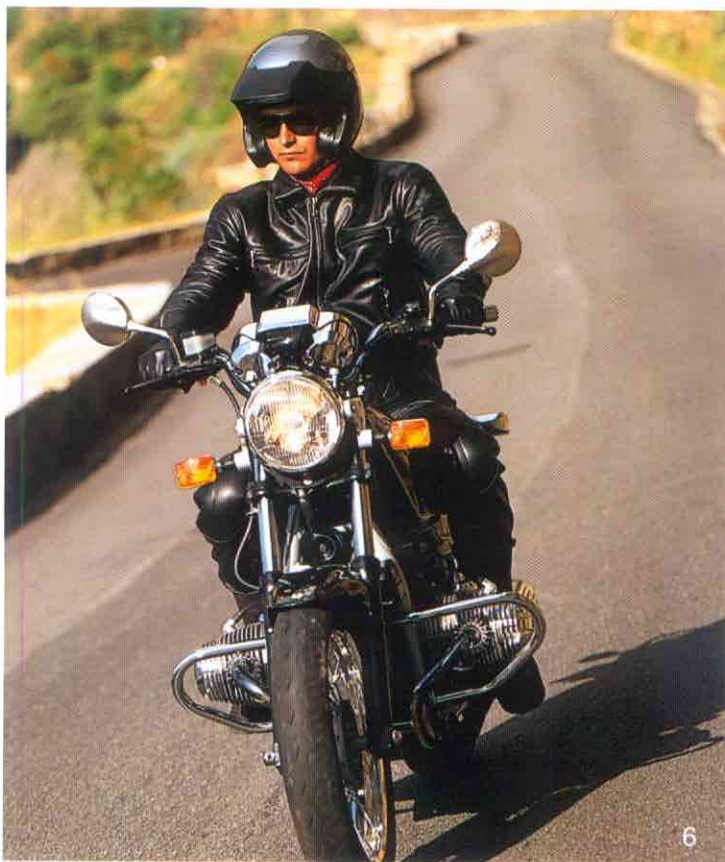
6 Ride the new BMW R 100 R "Roadster" in grand style wearing BMW's new Roadster leather suit.