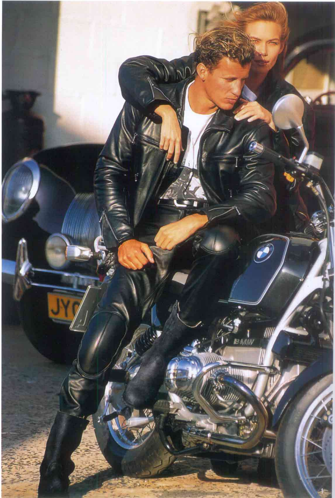
1 The new BMW R 100 R "Roadster" complete with BMW chrome kit and the BMW Road- ster leather suit.

Matching boots and gloves are also available to add the final touch to BMW's unique roadster look.